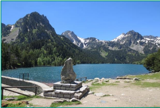
Lake of Sant Maurici.