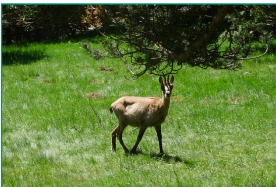
Isard (Pyrenees chamois).