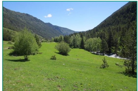
Valley of river Escrita.