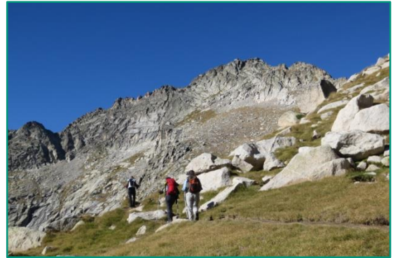
Going up col of Monestero with Peguera peak in the background.