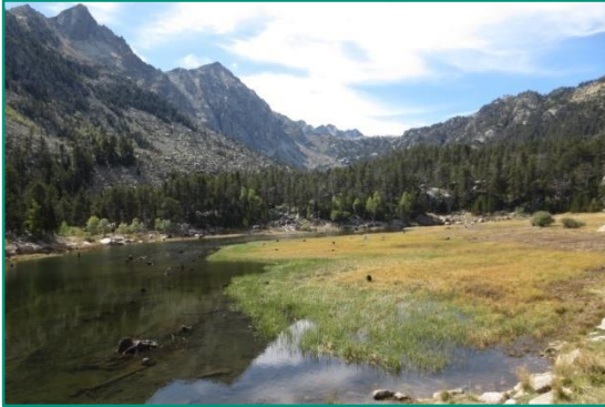
Lake of Lladres.