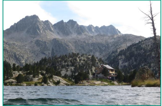
JMBlanc shelter and crest of Aviò in the background.